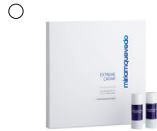
EXTREME CAVIAR BIO-REGENERATIVE SHOCK TREATMENT VITAMIN REINFORCEMENT