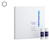
EXTREME CAVIAR BIO-REGENERATIVE SHOCK TREATMENT FOR HAIR LOSS