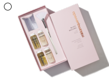
BLACK BACCARA BOND REJUVENATING LUXE CURE