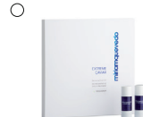
EXTREME CAVIAR BIO-REGENERATIVE SHOCK TREATMENT FOR DANDRUFF